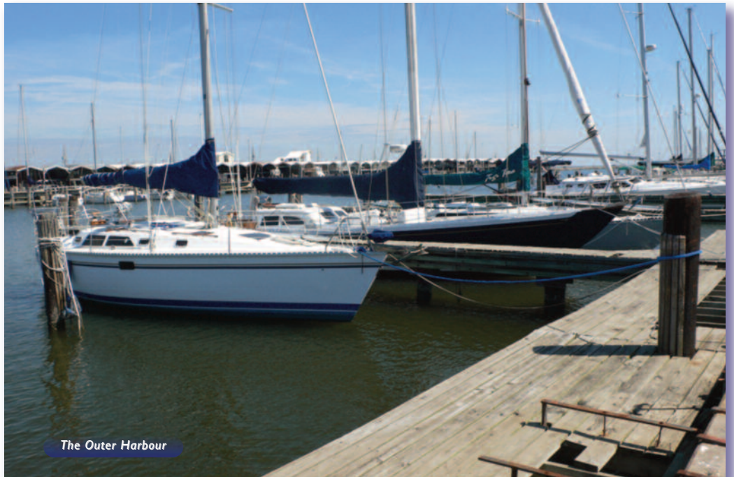
The Outer Harbour

As for intrepid boaters, Dixon agrees. 'It'll take a lot more than a little hurricane now and then to keep boaters from boating.' Coupled with the fact that the New Orleans area offers some of the best sailing opportunities anywhere along the Gulf coast, and a virtually guaranteed nine months of clement weather, boating in N'awlins is alive and well!